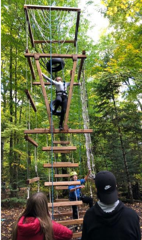
Climbing the quad