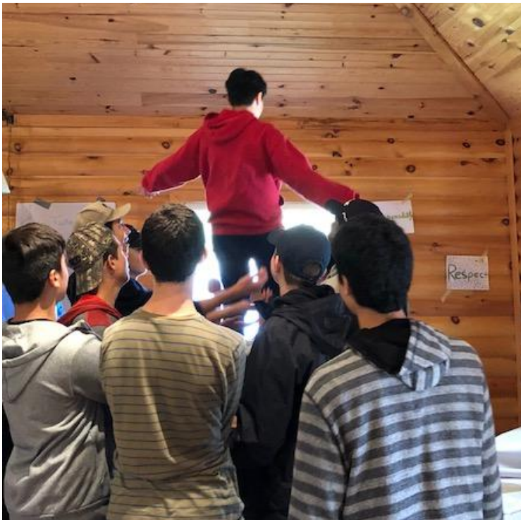
Trust fall at the Our School Our Community (OSOC) Workshop