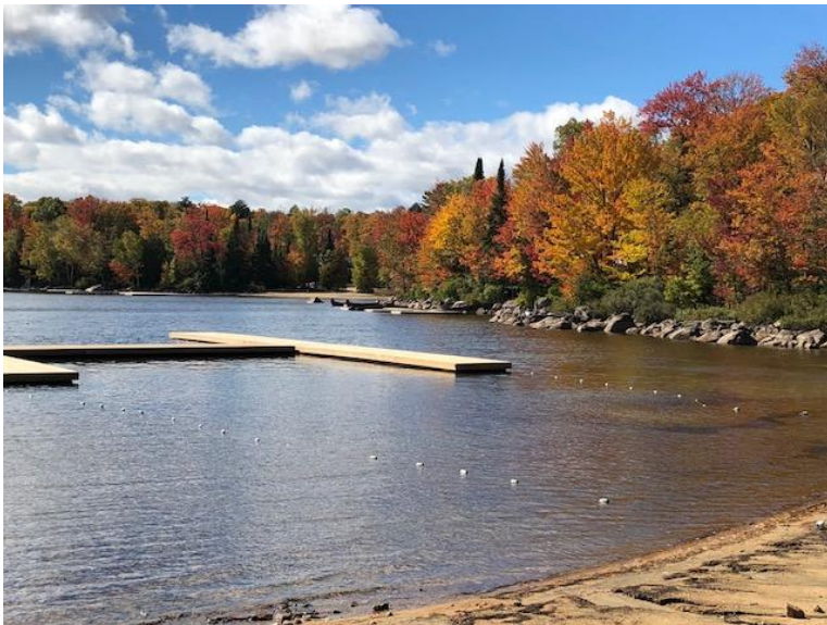
Some beautiful scenery at Camp Wanakita

More photos from ROC King on the @kingcity_ss instagram account!